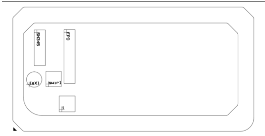
Figure 1. U-Processor Line Multi-Chip Package BGA Top-Side Markings