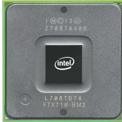
Figure 1-1. Example Component with Identifying Marks