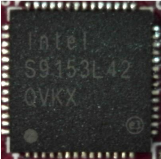
Figure 1-1 Snapshot of I225 I225, Specification Update, Revision 1.2

Figure 1-1 shows a snapshot of the I225 device: