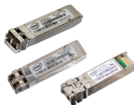
Intel Ethernet SFP28 Optics (SR, and SR and LR extended temp)