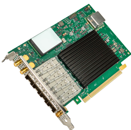
Intel Ethernet Network Adapter E810-XXVDA4T

U.FL connectors: Embedded coaxial connectors allow 1PPS signal connectivity between the adapter and motherboard or another adapter. Dedicated send and receive U.FL ports are embedded on the adapter.