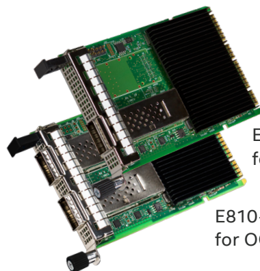
E810-CQDA1 for OCP 3.0