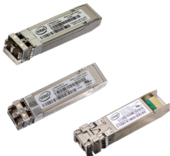
Intel Ethernet SFP28 Optics (SR, and SR and LR extended temp)

Intel Ethernet Optics and Active Optic Cables (AOCs) support multiple configurations and are fully compatible with the Intel Ethernet Network Adapter E810-XXVDA2 for OCP 3.0.