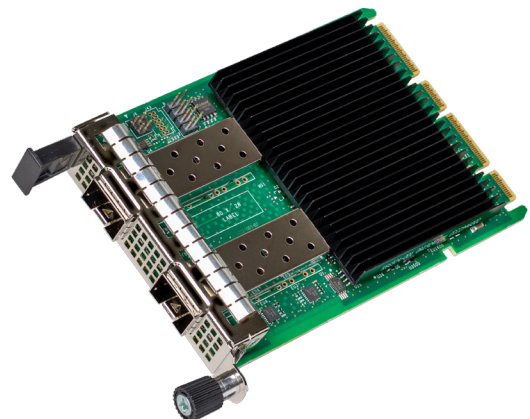
E810-XXVDA2 for OCP 3.0