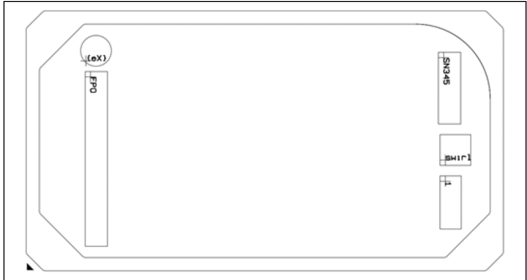
Figure 1. Tiger Lake Processor Based on UP3/H35-Processor Line Multi-Chip Package BGA Top-Side Markings